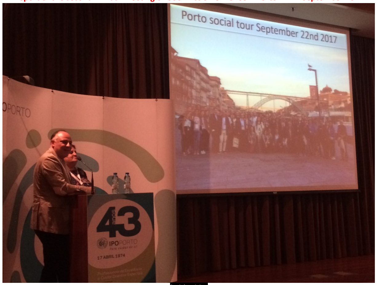
Report of the second Annual Meeting of COST Action CA15135 – Porto 22-24 September 2017