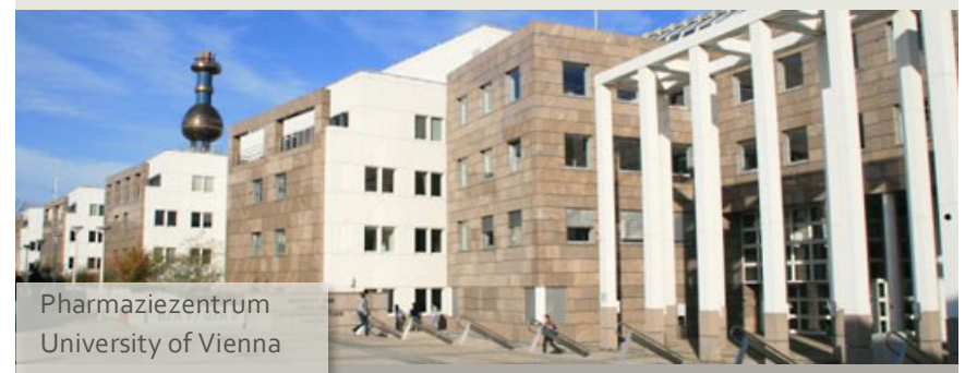
Pharmaziezentrum University of Vienna